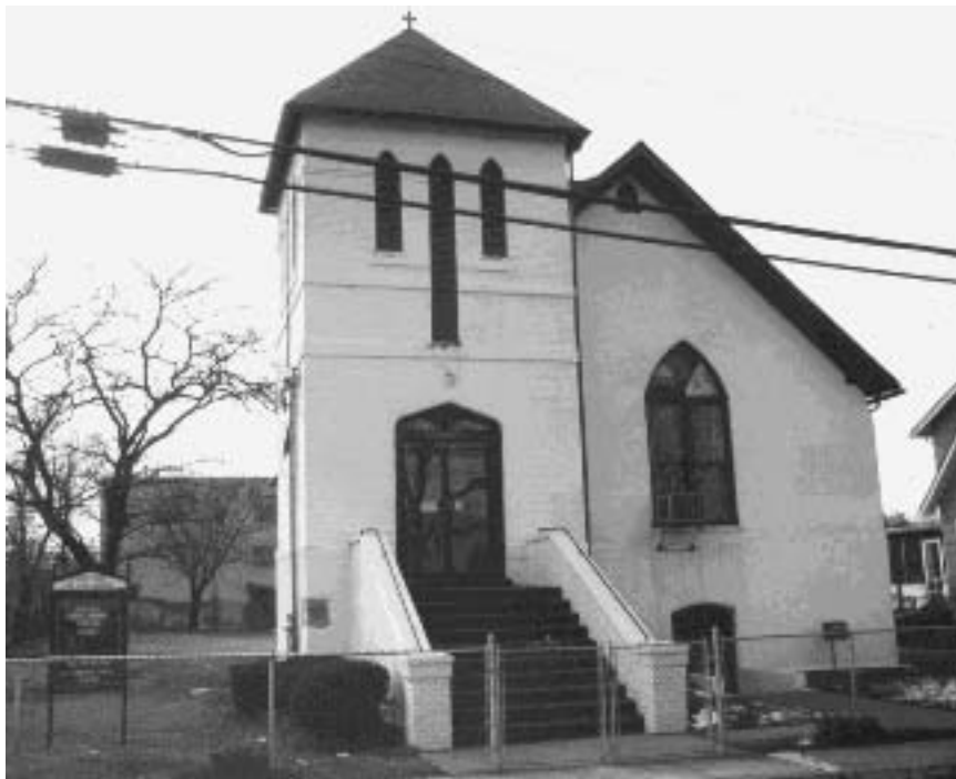
African Methodist Episcopal Zion Church, built 1920 in North Brentwood, a church which reflects the long history of African-American religious traditions in the county.

Rossborough Inn and Brown's White House Tavern reflect the history of the old Washington and Baltimore Turnpike system. Built circa 1803 and 1834 respectively, they served for many years as stopping places for stagecoach travelers on the road until the Baltimore and Ohio Railroad put the stage line out of business. Both buildings have served a variety of purposes since that time. Restored and renovated in the 1930s, the Rossborough Inn is now the home of The University of Maryland's Faculty and Alumni Club. Brown's White House Tavern served for more than 50 years in this century as the center of a motel complex; now in deteriorating condition, the tavern building awaits restoration as part of a commercial/office development. The original turnpike milestone (the only surviving milestone from this turnpike) was removed from the tavern grounds for safekeeping in 1998 and will be returned and stabilized once the tavern is restored.