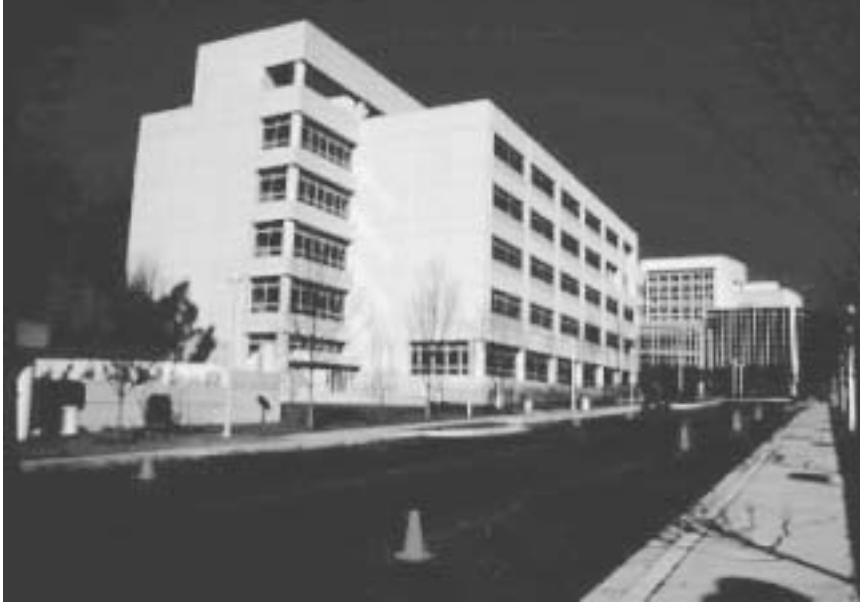
National Archives and Records Administration (Archives II) in College Park houses records created or received by the federal government, and is open to the public for research and study.

Montpelier Mansion and also owned by M-NCPPC, the center houses three galleries, classrooms, workshops and studio space. Cultural events in both the visual and performing arts are offered regularly and include visual art exhibits, classical music competitions, masters' workshops, and dance programs. The center is open seven days a week.