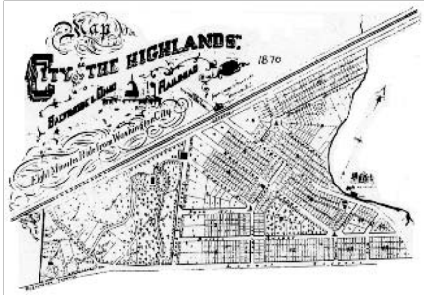
Shown here is the 1870 plat for The Highlands. The envisioned community never materialized (only one early house survives), and the land was developed as Cottage City in the 1920s.

Wells. The first residents were attracted to the area by the ease of transportation to Washington, D.C., via the Baltimore and Ohio Railroad and the City and Suburban Streetcar line. Several outstanding examples of late Victorian domestic architecture survive in Edmonston.