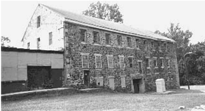
Laurel is one of 14 municipalities in ATHA; the town grew as a result of the mill industry. Shown here is Avondale Mill (built in the early 19th century), which was destroyed by fire in 1991.

The Town of Bladensburg, established in 1742 and incorporated in 1854, was an important colonial port and the site of the Battle of Bladensburg in August 1814. Although the community has undergone many changes, a number of significant historic buildings remain from the colonial and early federal periods, including three 18th-century residences, an 18th-century commercial building and an early 19th-century church.