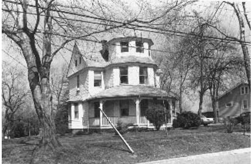
Built in 1888 from a Victorian pattern book plan, this is one of the first houses in the town of Berwyn Heights.

Platted in 1889, Riverdale Park was laid out around the tracks of the Baltimore and Ohio Railroad on the portion of the Riversdale plantation that included the 1801 mansion of the Calvert family. The subdivision was unusual in that it focused on the plantation house as a central amenity and was laid out as a “village park,” including traffic circles and other park areas reserved as public green space. The forms and styles of the buildings range from the Queen Anne transitional of the 1890s to the craftsman-inspired bungalows of the 1930s. Riverdale Park was incorporated in 1920 and is in the early stages of seeking local historic district designation.