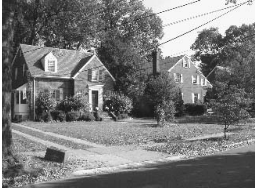
Shown here is a typical streetscape in University Park, a residential suburb developed in the 1920s and 1930s for an automobile society. It is one of four National Register Historic Districts in the Anacostia Trails Heritage Area (along with Mount Rainier, Greenbelt and Hyattsville).

“greentowns” built by President Roosevelt’s New Deal Resettlement Administration of the late 1930s in response to the nation’s shortage of low- and moderate-income housing. Greenbelt was conceived by Rexford G. Tugwell of the Resettlement Administration, whose dream was to provide housing within the format of a self-sufficient community with open space for recreation. Incorporated in 1937, Greenbelt was the most successful of the greentowns: it retains its original plan and International-style buildings, most with very few alterations. The Greenbelt Center School, a designated Historic Site, is an outstanding example of the streamlined Art Deco style.