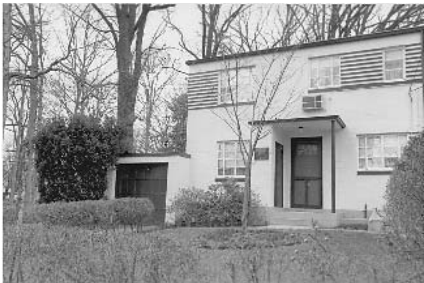
The Greenbelt Museum is located in one of the units of the 1937 planned "greentown." It is fully furnished to its original period and tells the history of this Depression-era community.

The museum also has an exhibition space in the Art Deco-style Greenbelt Community Center that contains changing interpretive exhibits. The Community Center's outer wall features dramatic limestone friezes depicting the Preamble to the Constitution created by New Deal sculptress Lenore Thomas. The museum's collection includes an extensive library of photographs and print materials.