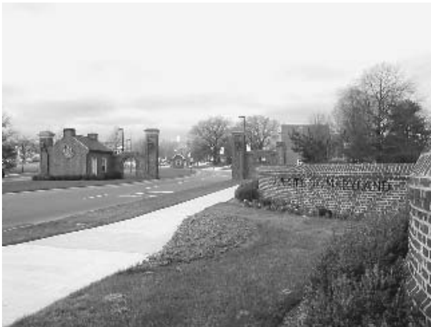
The main entrance to the College Park campus of The University of Maryland, one of the nation's best-equipped campuses.

In 2001, the university opened the Clarice Smith Performing Arts Center. This facility is a collaborative effort of the state, Prince George's County, and the university and promises to provide a superb environment for the study, practice and enjoyment of the arts. The University