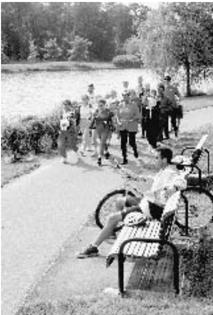
Hikers and bikers alike enjoy the trails at Lake Artemesia.

An outstanding variety of leisure-time options for both participants and spectators is available within the Anacostia Trails Heritage Area. (See Map 4.) M-NCPPC, which oversees most of the recreational facilities within the Heritage Area, has an award-winning parks system. M-NCPPC manages 18 neighborhood parks, 6 community centers, 4 playgrounds, 2 swimming pools, several ballfields, an ice rink, Bladensburg Waterfront Park, and Lake Artemesia, all along the 15-mile-long Anacostia Tributary Trails System. Paint Branch Golf Course is a nine-hole, public golf facility that includes the Golden Bear golf training center. It is linked via the trail system with the Linson/Wells Recreational Complex, where a 50-meter swimming pool and an ice skating rink covered for seasonal use are available for residents and visitors. M-NCPPC also operates Fairland Regional Center in Beltsville, which includes an aquatics complex and an indoor ice skating rink. Some municipalities, such as Laurel, Greenbelt and College Park, also offer park and recreation facilities and programs.