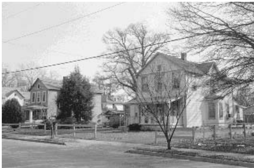
A typical streetscape in Edmonston, a small community which began to develop circa 1900 along the railroad and streetcar lines.