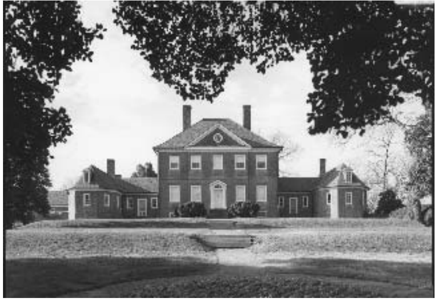
Montpelier Mansion, built for the Snowden family in the 1780s, is one of four National Historic Landmarks in the Heritage Area.

Eighteen individual houses within the district are included in the county's Historic Sites and Districts Plan as Historic Sites or historic resources. The county's Historic Sites, resources and districts are shown on Map 2.