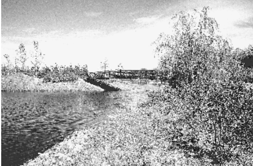
One of the hiker-biker bridges at Lake Artemesia, part of the Anacostia Tributary Trails System.

Aviation Museum with Lake Artemesia and the Berwyn Heights Neighborhood Park.