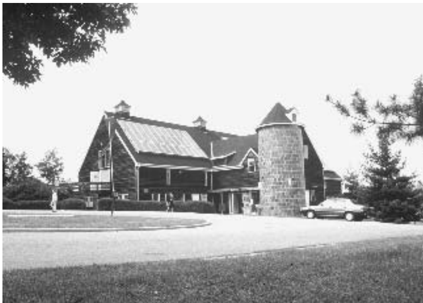
The classrooms, galleries and studios of the Montpelier Cultural Arts Center are housed in a modern barn structure on the grounds of Montpelier Mansion.

The Publick Playhouse in Cheverly is owned by M-NCPPC. It presents many professional programs with nationally known artists; however, its