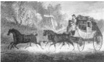
A stagecoach on the Washington and Baltimore Turnpike (present-day US 1) near Vansville, shown here in a print of about 1830. The sign reads to Was n 10 M s (10 miles to Washington).

perfected their Wright B flyer at the first United States Army Signal Corps airport in the nation at College Park, which is now the oldest continuously operated airport in the world. And the hub of all journeys into space to the moon and beyond is located here at the NASA Goddard Space Flight Center.