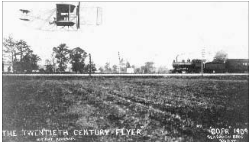
Each successive century has seen the development of a different mode of transportation. This 1909 photograph shows a Wright aeroplane flying over a train on the Baltimore & Ohio Railroad tracks near College Park Airport.

perfected their Wright B flyer at the first United States Army Signal Corps airport in the nation at College Park, which is now the oldest continuously operated airport in the world. And the hub of all journeys into space to the moon and beyond is located here at the NASA Goddard Space Flight Center.