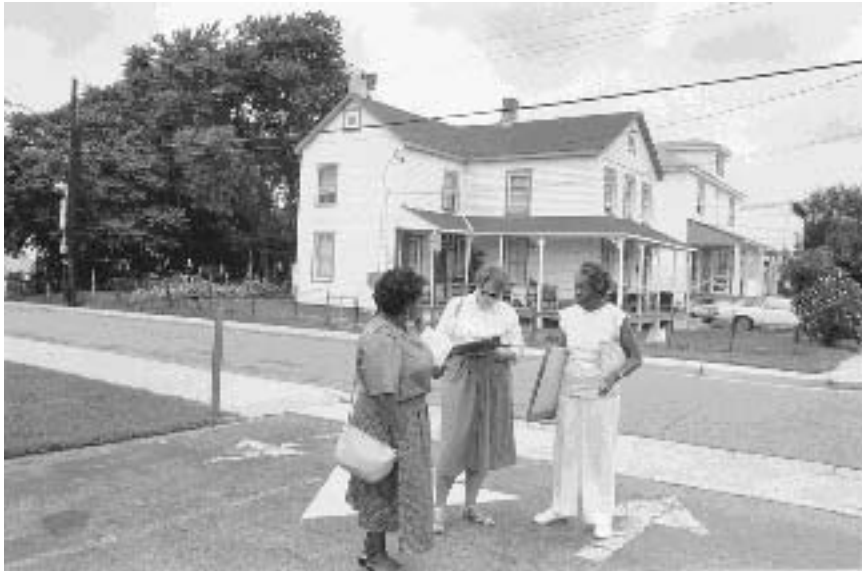
M-NCPPC staff and town residents begin the historical/architectural survey of North Brentwood, Prince George's County's first black municipality.