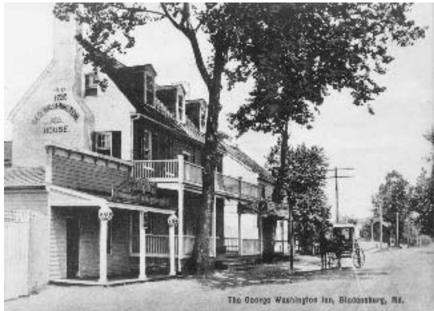
An early photograph of the George Washington House, built as a store circa 1760, and later one of several taverns on the Washington and Baltimore Turnpike, now US 1.