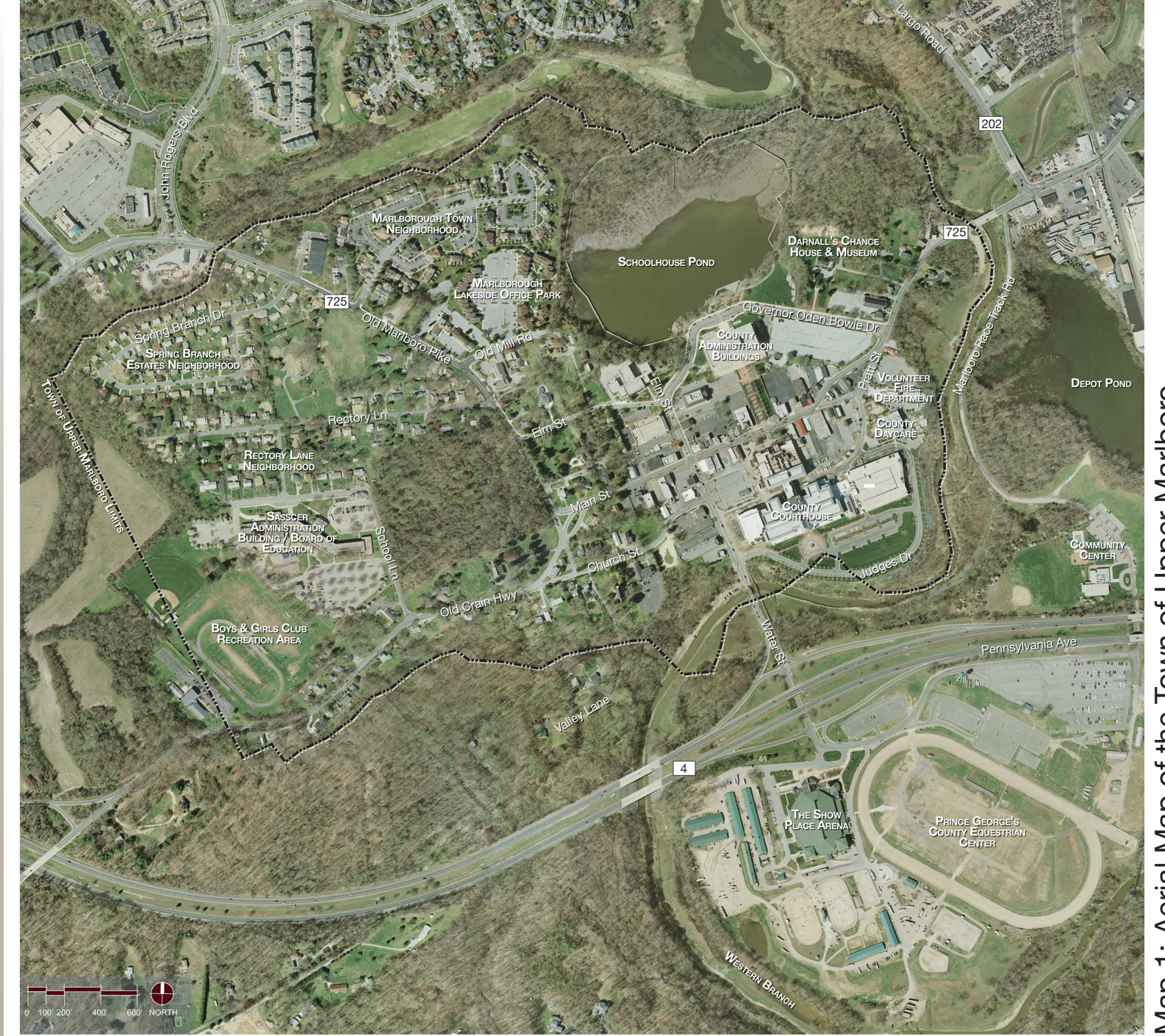
Map 1: Aerial Map of the Town of Upper Marlboro