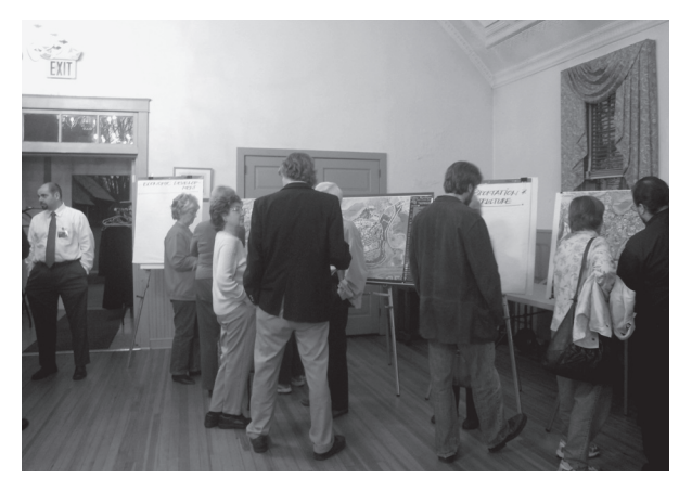
Final Public Meeting—September 2008