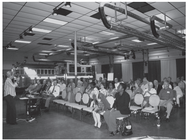
1st Public Meeting

The 2008 Town of Upper Marlboro Action Plan revisits, reconfirms, and expands the goals of the 1993 master plan to best represent the input of the community and the 2008 Action Plan Advisory Committee. The community planning effort for the 1993 master plan was extensive, and it was widely agreed that the 1993 plan's principles should serve as the foundation for this plan update. Each of the 1993 plan goals and supporting objectives listed below was evaluated against input received throughout the Upper Marlboro planning process and was determined to merit inclusion in this new Action Plan. The 1993 goals were supplemented with additional goals and objectives where new items arose in the process. The resulting Town of Upper Marlboro Action Plan represents a continuation of the 1993 vision, adapted to fit the 2008 context.