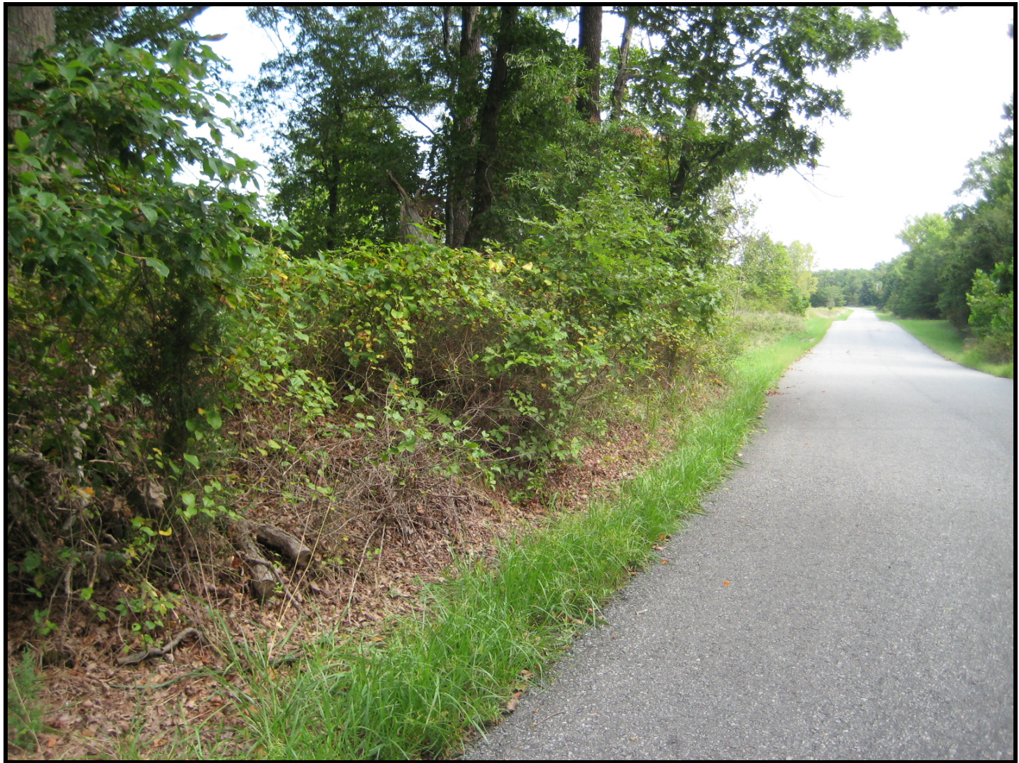
Photo: Townshend-Robinson Family Cemetery, Brandywine, grade change, looking north. (August 2009)