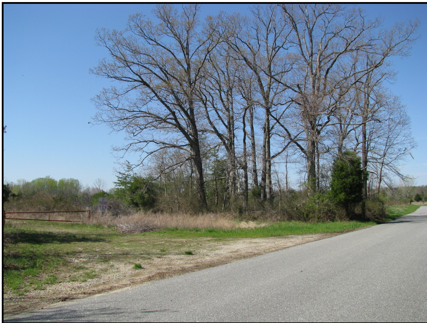
Photo: Townshend-Robinson Family Cemetery, Brandywine, looking northwest. (April 2009)