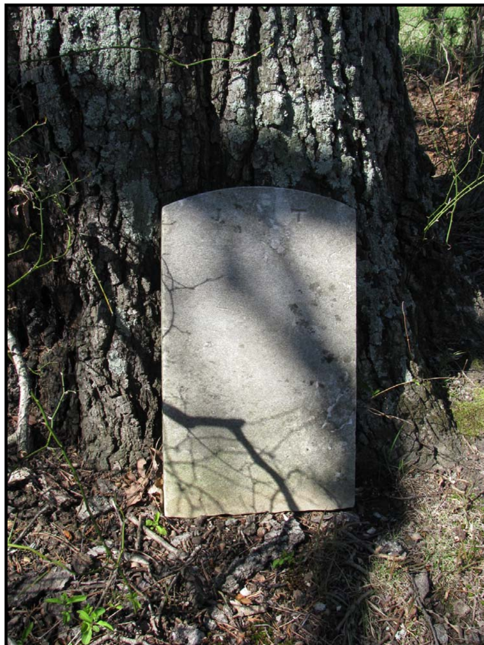
Photo: Townshend-Robinson Family Cemetery, Brandywine, John Townshend footstone, looking north. (April 2009)