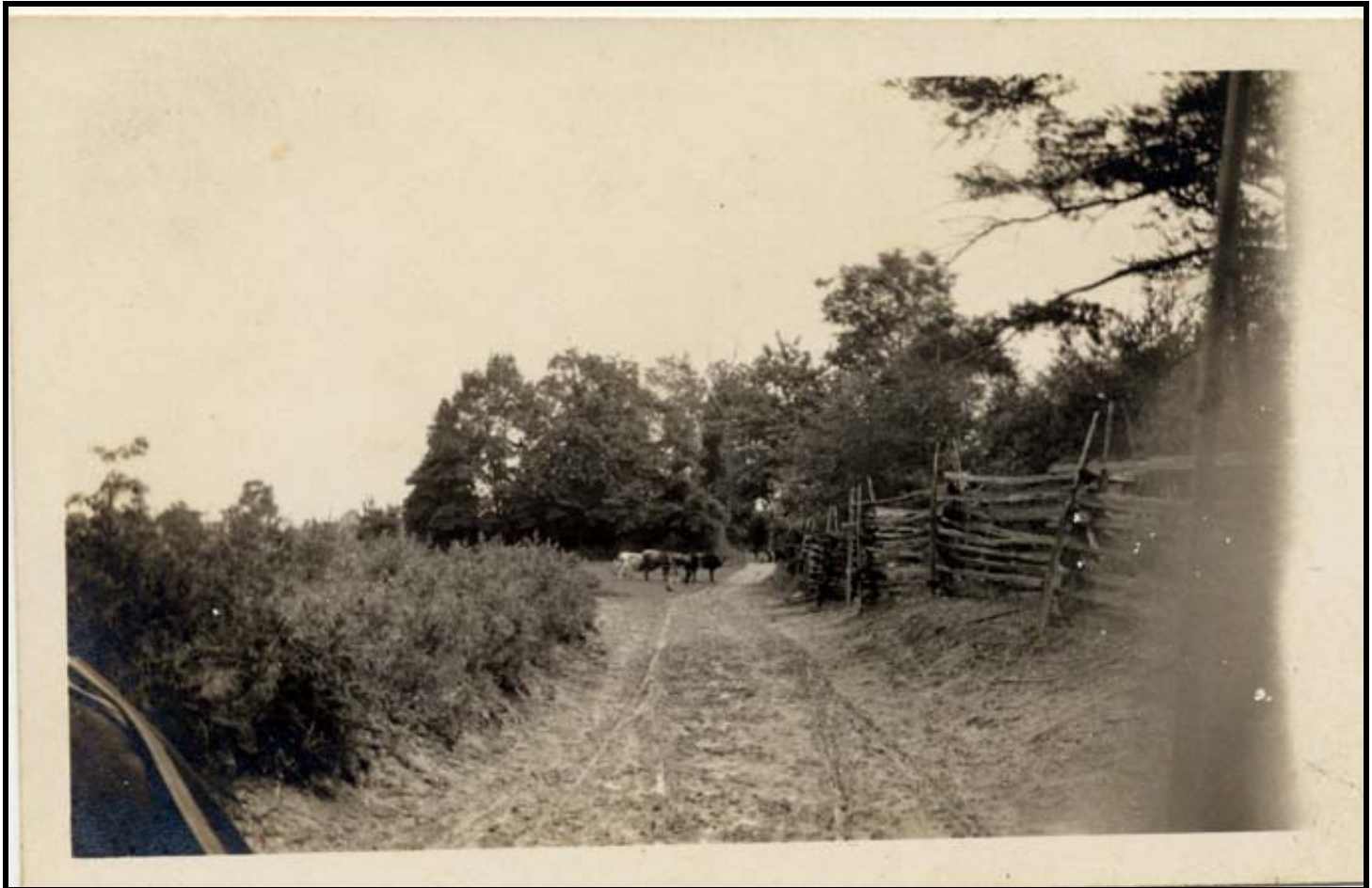
Photo: Townshend-Robinson Family Cemetery, View of the cemetery from the south, early twentieth century.