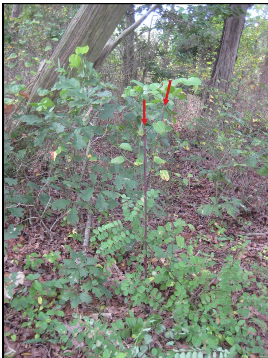
Photo: Townshend-Robinson Family Cemetery, Brandywine, line of metal poles marking burials, looking south. (August 2009)