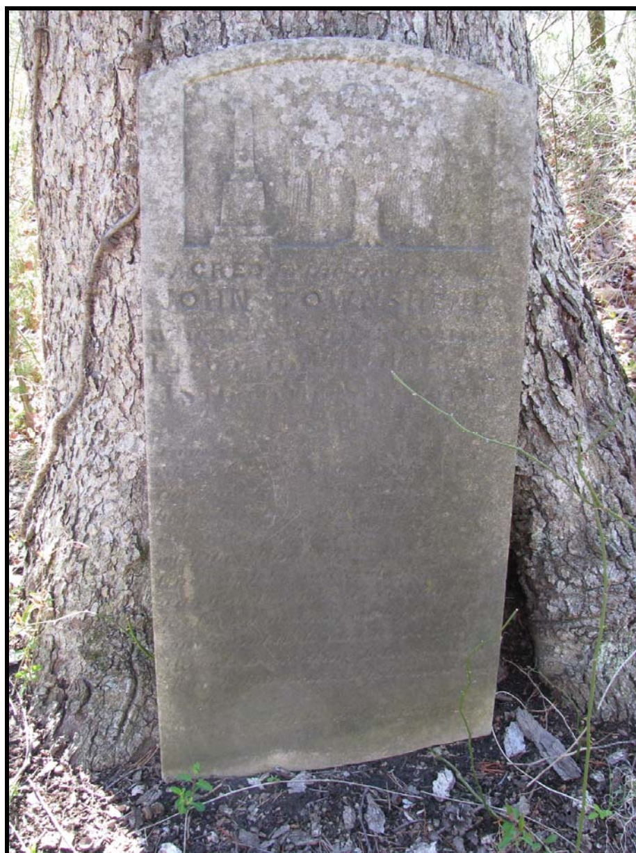
Photo: Townshend-Robinson Family Cemetery, Brandywine, John Townshend headstone, looking southwest. (April 2009)