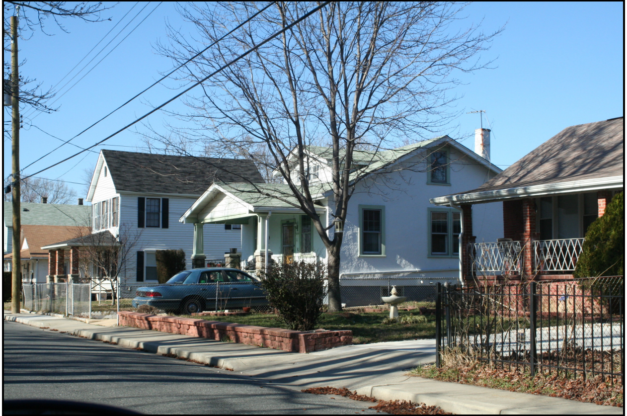
Looking northwest, 3920-3918 Allison Street