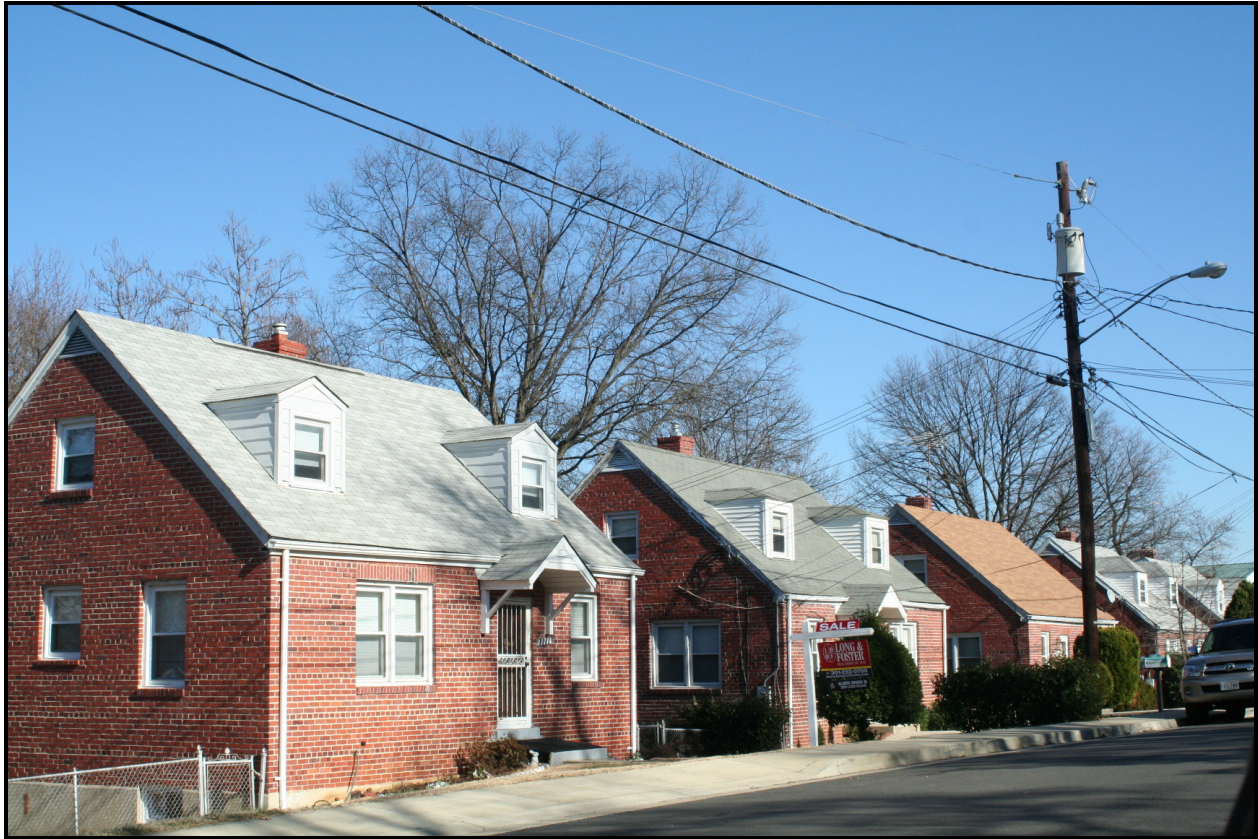
Looking northeast, 3908-3910-3912 Wallace Road