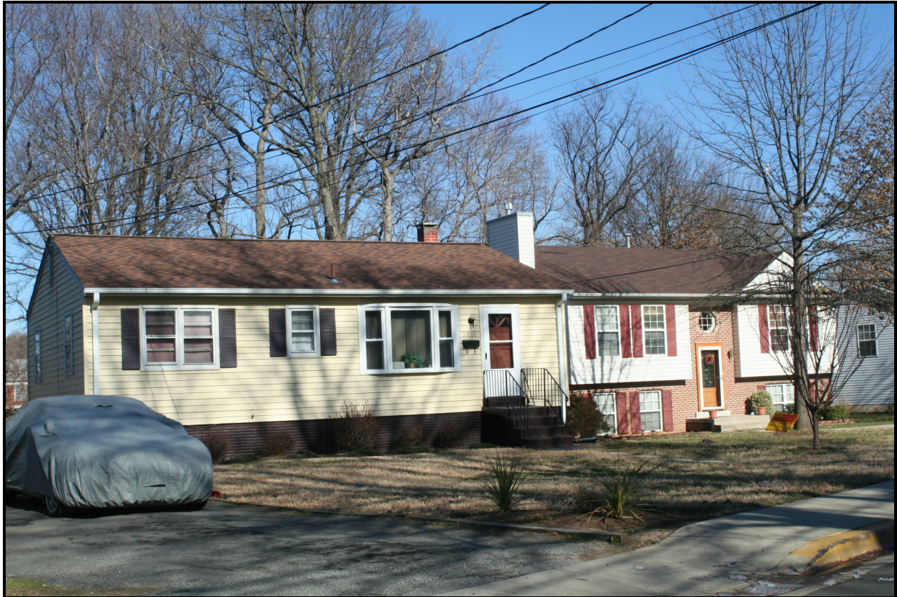
Looking northeast, 3908-3910 Windom Road