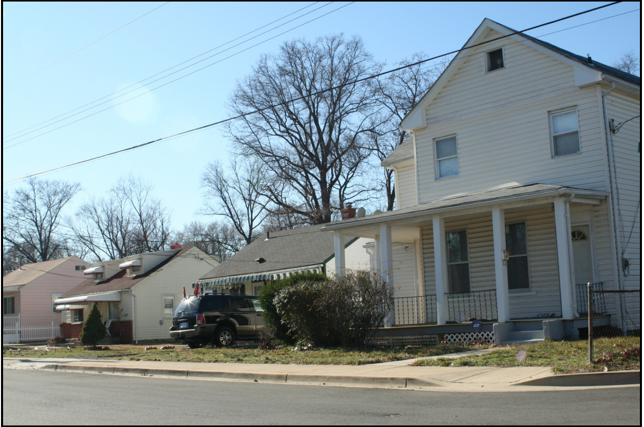
Looking west, 4528-4526-4524 39th Place