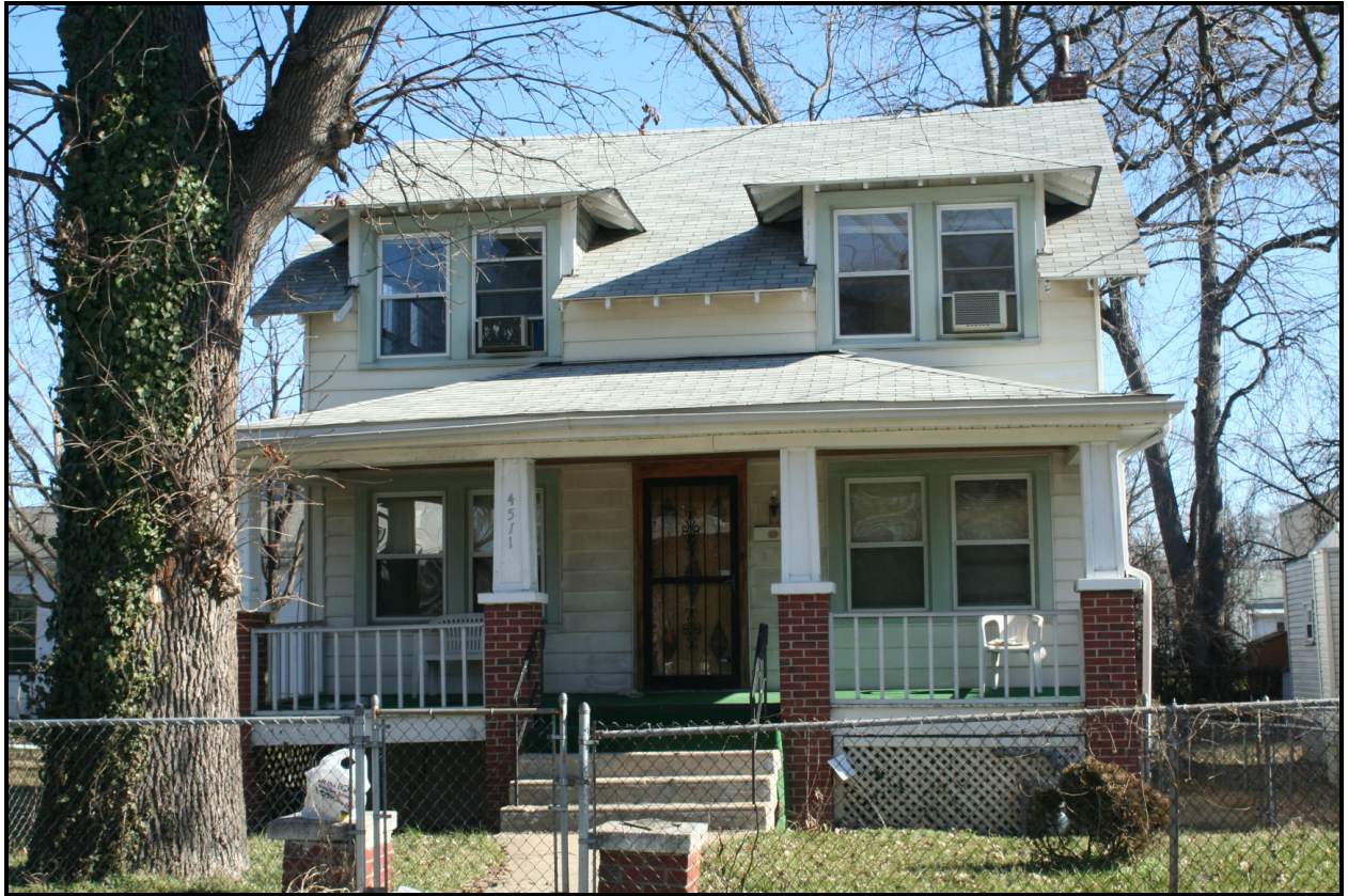
Looking southeast, 4511 40th Street ( EHT Traceries, 2008 )