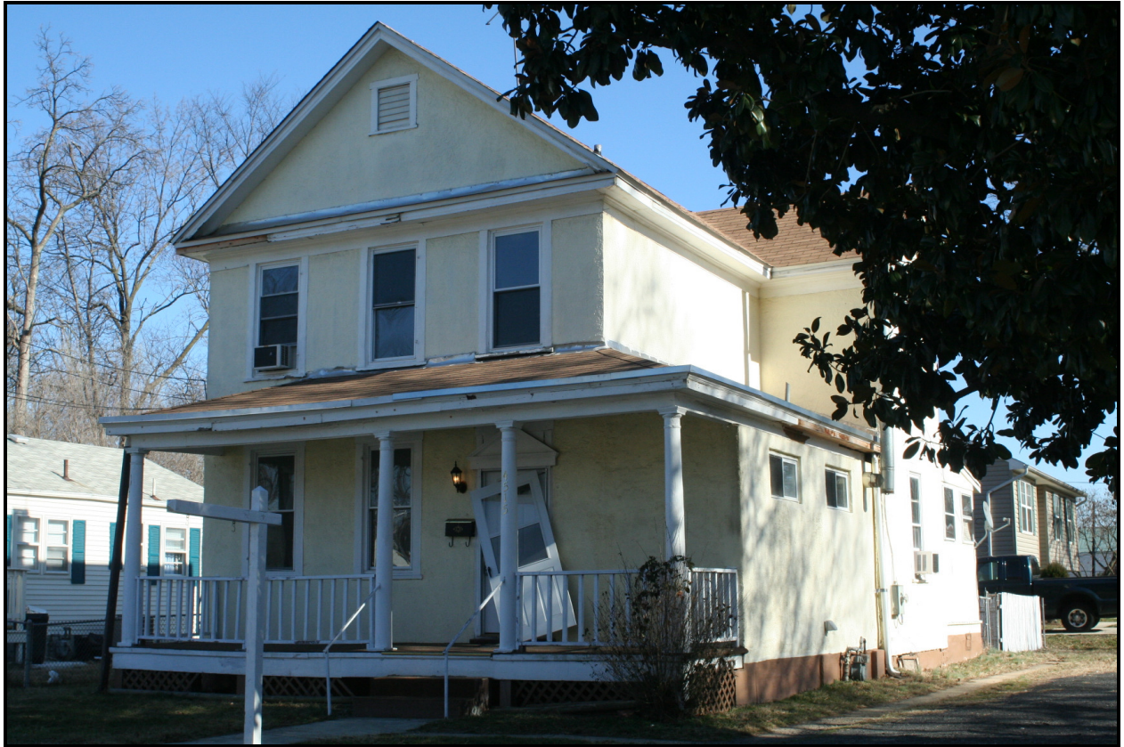
Looking southeast, 4515 39th Place ( EHT Traceries , 2008)