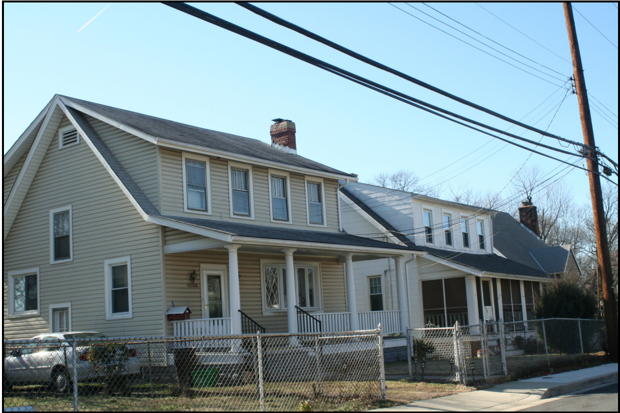
Looking west, 4035-4033 Webster Street