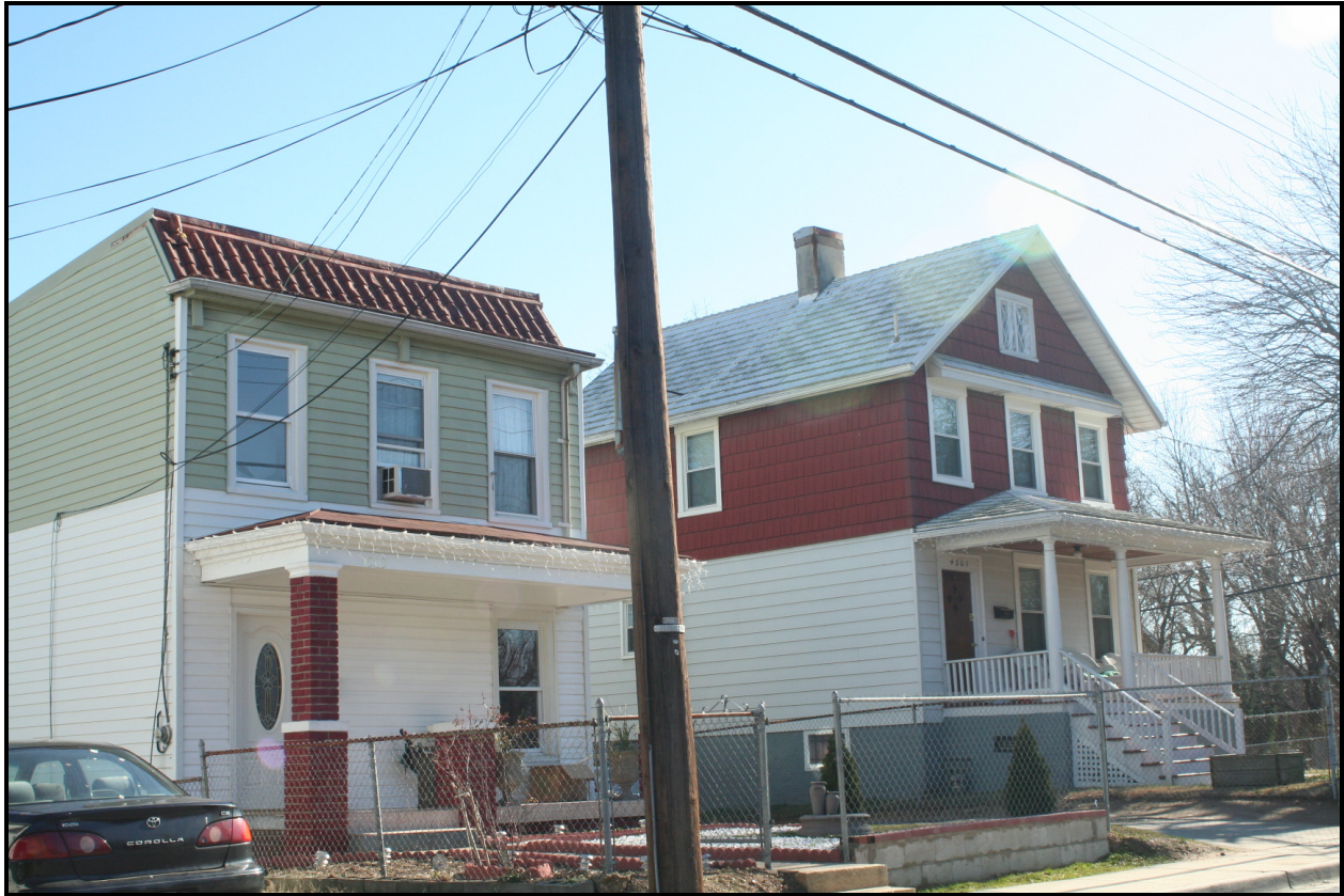
Looking south, 4503-4501 40th Street