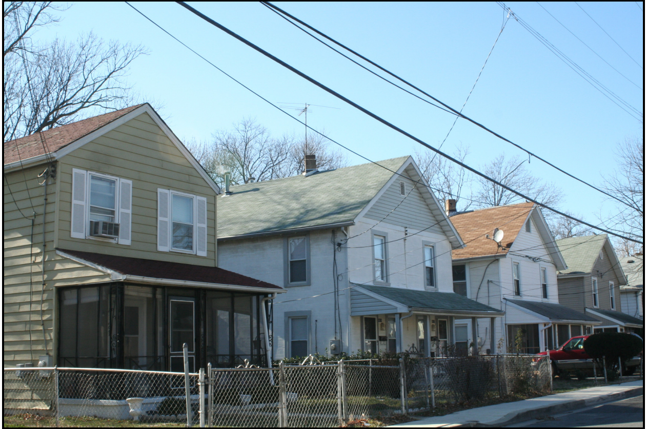
Looking west, 4021-4019-4017-4015 Webster Street