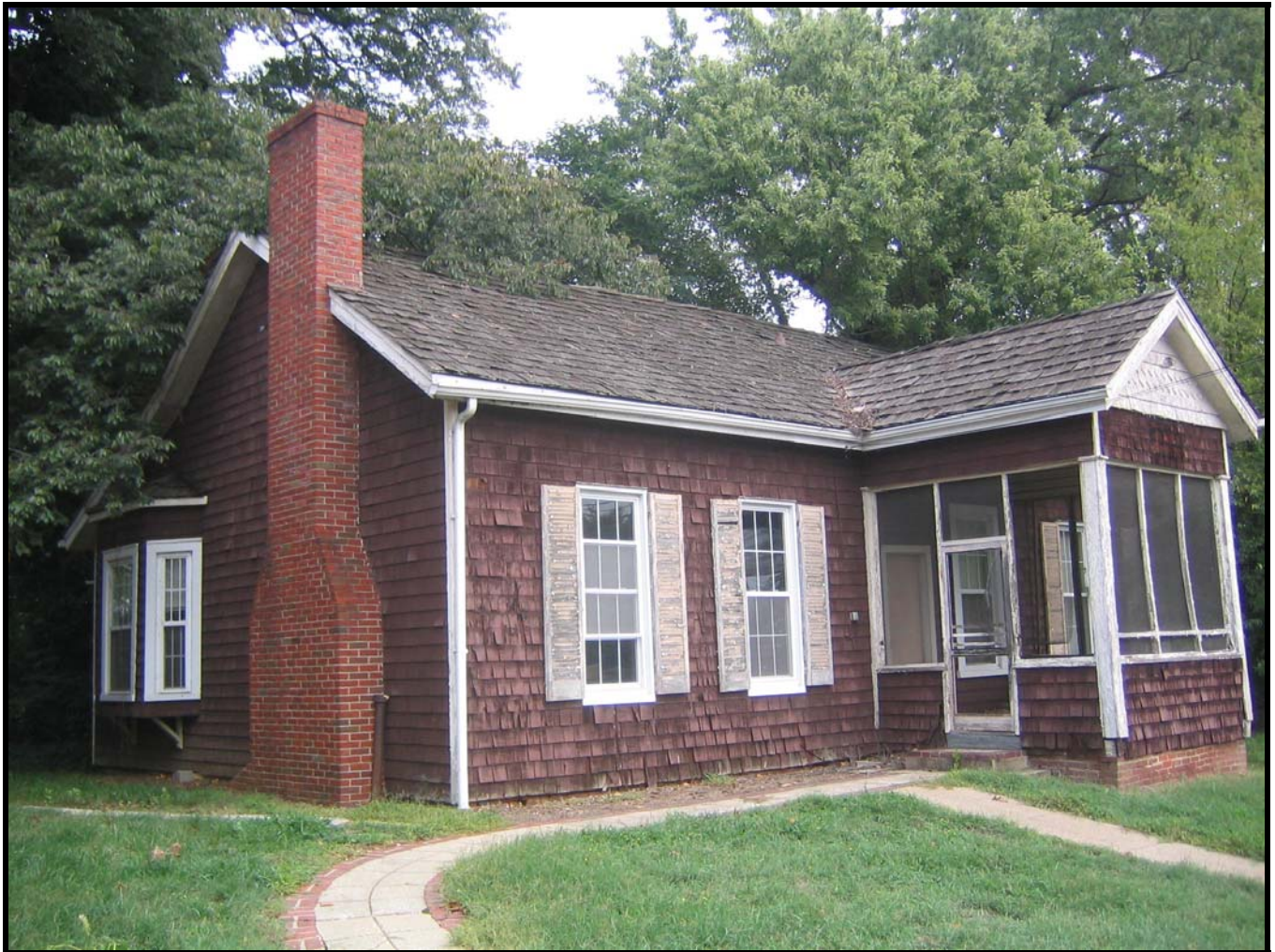
Photo: Old Marlboro Primary School, view of the southwest corner, looking northeast. (August 2007)