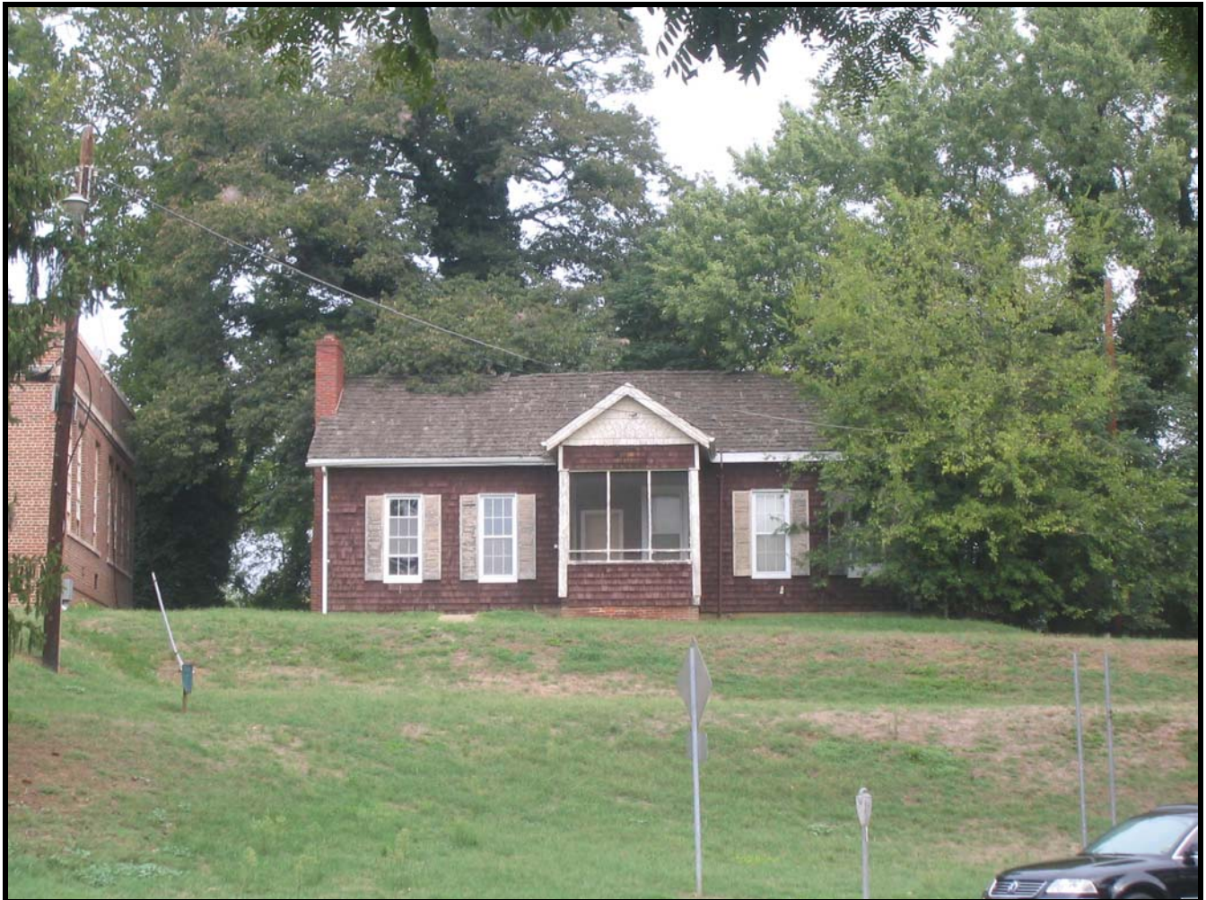
Photo: Old Marlboro Primary School, view of façade (south elevation), looking north. (August 2007)