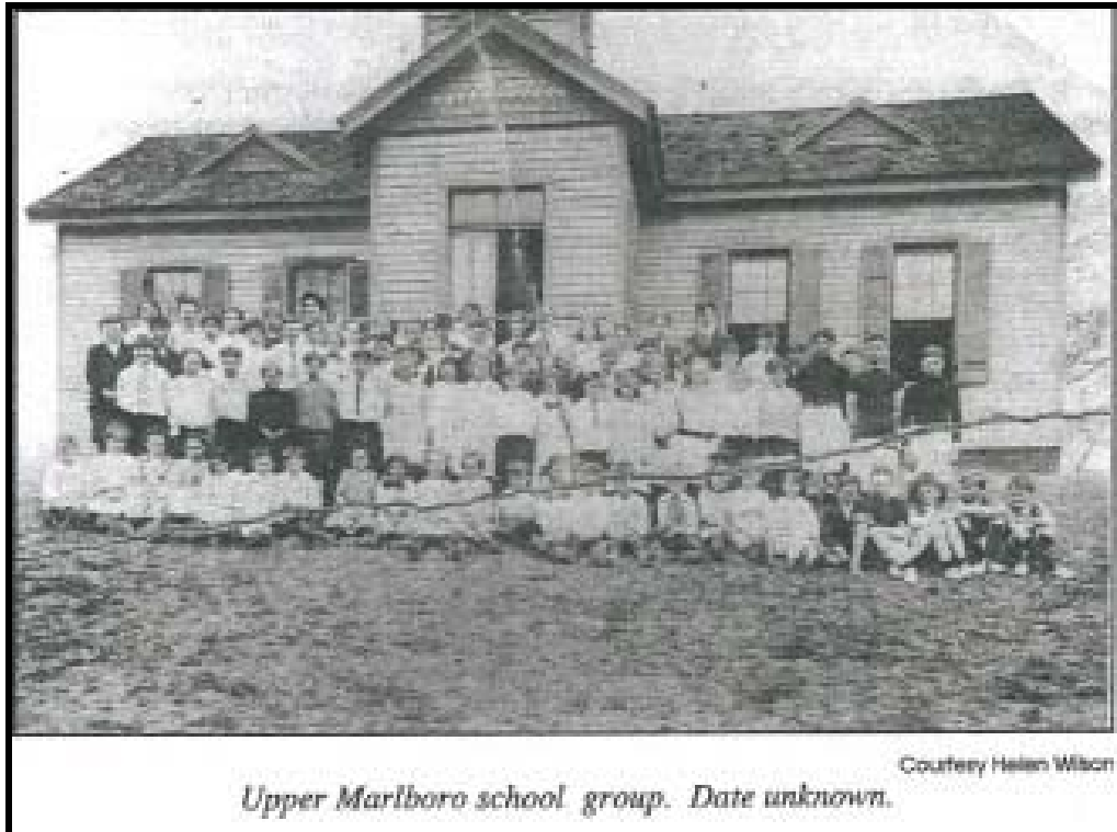
Photo: Old Marlboro Primary School, view of the façade (south elevation), looking north. (Date unknown) 15