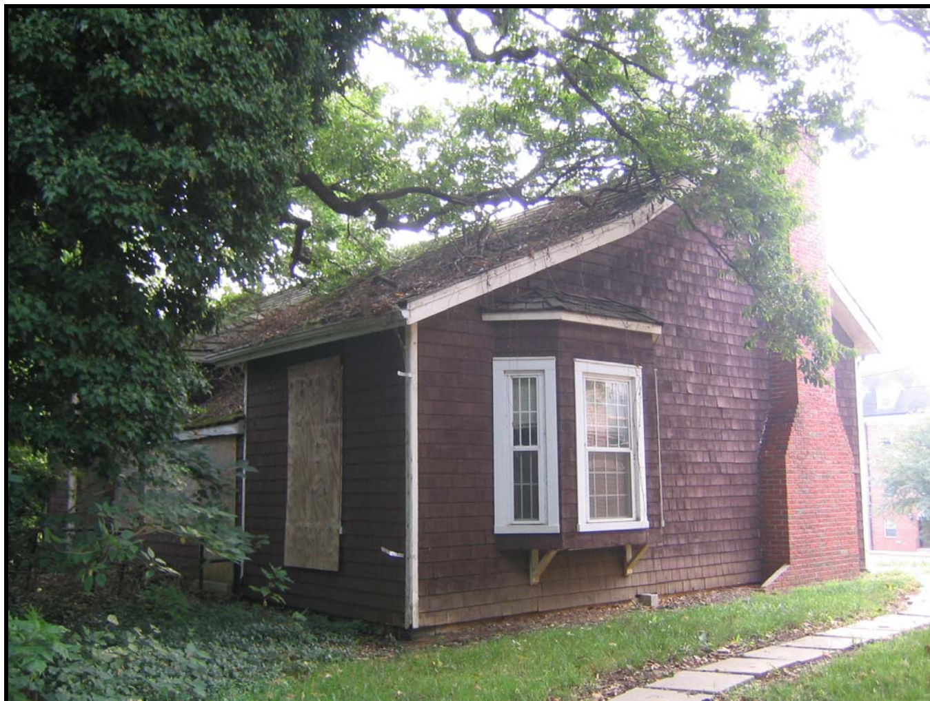
Photo: Old Marlboro Primary School, view of the northwest corner, looking southeast. (August 2007)